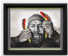
Sydney G. James Bereavement? (masculine) , 2023 Charcoal, workmen shirts, safety vest, duct tape, reflective fabric trim, and gel medium on watercolor paper 40.5 x 50.5 inches, framed (34 x 44 inches unframed) (14702)