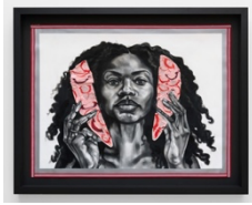
Sydney G. James Bereavement? (feminine) , 2023 Charcoal, non-medical masks, tape, reflective fabric trim and acrylic on watercolor paper 40.5 x 50.5 inches, framed (34 x 44 inches unframed) (14701)