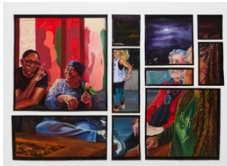
Sydney G. James Unstoppable Together , 2023 Acrylic and tape on canvas 82 x 120 inches (14697)