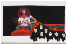
Sydney G. James Serving Tee Liberation , 2023 Acrylic, t-shirts, fabric, and gel medium on canvas 113 x 191 inches (14699)